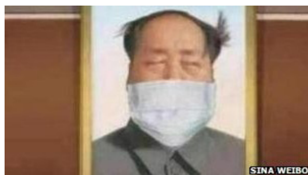
Fig. 2: MAO PORTRAIT.