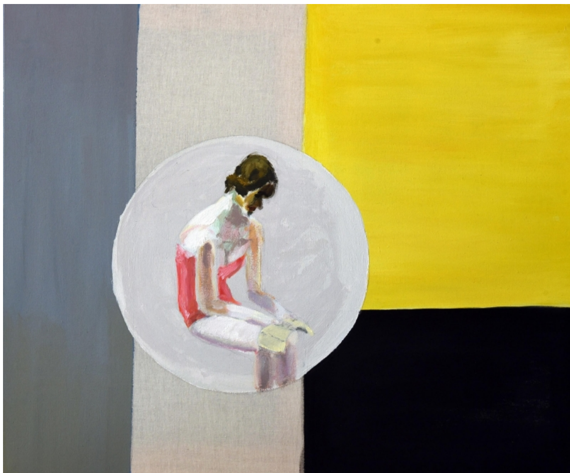
Figure 1. Phelan, Hotel Room Revisted (acrylic on canvas, 2017)