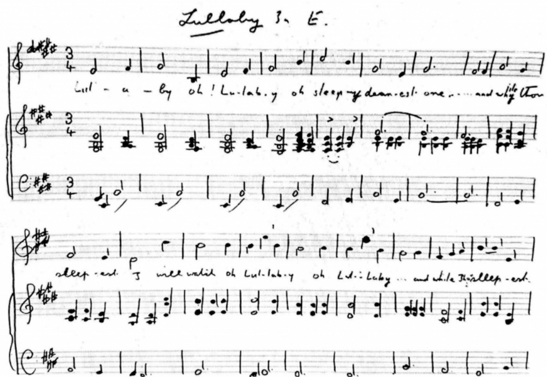
Fig. 1: “Lullaby in E”, 1924 (Britten 1924a)