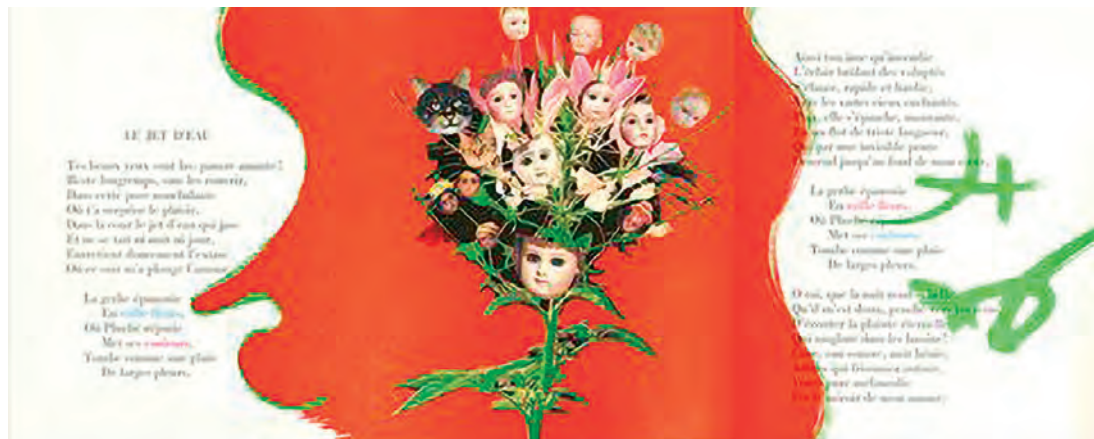
Fig. 7: Charles Baudelaire, Les Fleurs du mal , illustrations by Roger Bezombes, Paris: Les Bibliophiles de l'Est, 1985.

frame extends the textual meaning and allows the reader to muse about the infinite possibilities of the verbal-visual intersections presented here.