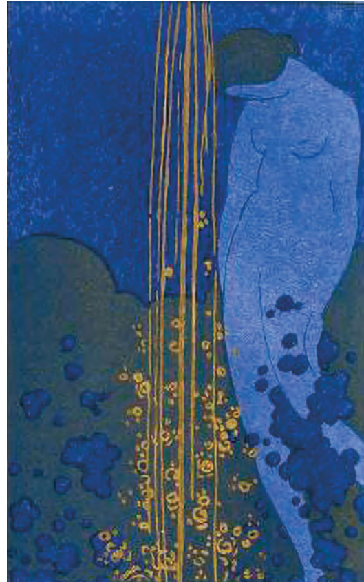
Fig. 8: Charles Baudelaire, Les Fleurs du mal , illustrations by André Domin, Paris: Editions René Kieffer, 1920.

In this illustration, the female presence is felt through a series of simple strokes outlining her form. They are more easily visible in the initial version of the poem prior to the addition of the pochoir