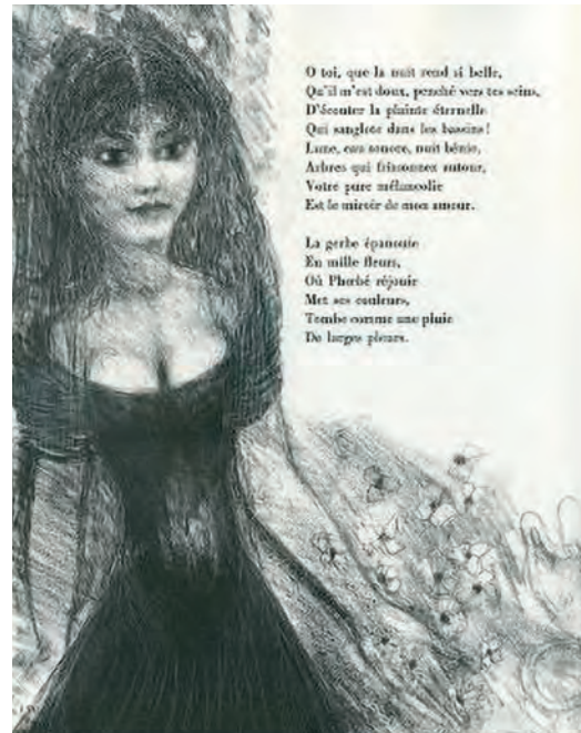
Fig. 6: Charles Baudelaire, Les Fleurs du mal , illustrations by Édouard Goerg, Paris, Marcel Sautier, 1952. Third illustration of three-page spread.)

A closer look at the illustration may help clarify this idea. At first, nothing here seems to address the melancholic tone of the text. And yet, upon further inspection, the stem of the flower appears to be that of a thistle. Furthermore, the doll heads, intermingled as they are with thorns, are set against a black background. Is this the artist's subtle indication that the ecstatic interlude, so aptly captured in the text, cannot be maintained ("entretenir" is Baudelaire's verb choice) past the poetic universe in which it is situated? Is this also a reminder that all flowers eventually wither and die? And, finally, is this why "La grebe épanouie / En mille fleurs" of the refrain eventually falls into the base of the fountain in "larges pleurs" or large tears? Bezombes choses to picture a single element from Baudelaire's text, but his articulation of it proposes a glass through which the entire poetic gesture comes into focus. In doing so, the artist moves beyond mimesis. He brings to the text a visual scape that "reads" it in new ways and thus offers far more than rote reproduction of textual information. Rather than resigning itself to a secondary role of sedentary slavery to the poem, Bezombes' pictorial