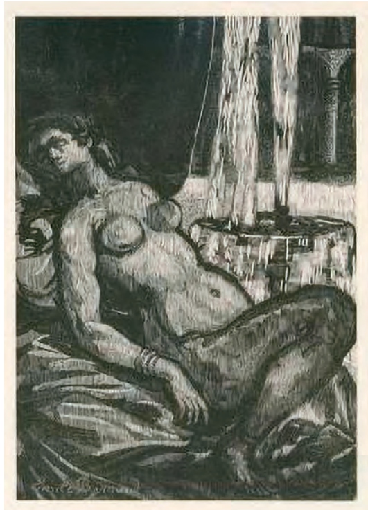
Fig. 3: Charles Baudelaire, Les Fleurs du mal , illustrations by Émile Bernard, Paris: Ambrose Vollard, éditeur; l'Imprimerie Nationale, 1916. (Second illustration.)

together in Baudelaire's text. Left to the viewer's imagination is the rest of the decor in this image. What interests the artist is the relationship between the poem's major players as they are synthesized into a single entity of desire, his sole focus. In this way, Bernard's imagery extrapolates upon the text and provides a way of approaching it with added insight.