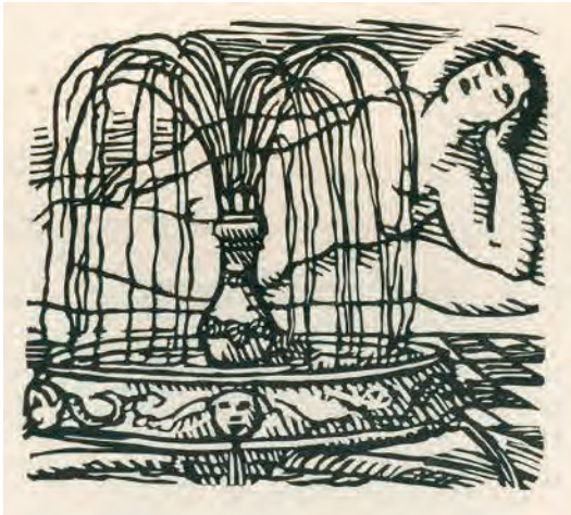
Fig 2: Charles Baudelaire, Les Fleurs du mal , illustrations by Émile Bernard, Paris: Ambrose Vollard, éditeur; l'Imprimerie Nationale, 1916. (First illustration.)

than please the eye of the beholder. In sum, this is representational illustration in the most traditional sense of the term. There is no attempt on the part of the artist to extend the meaning of the text onto the graphic plane or to transcend mimesis.