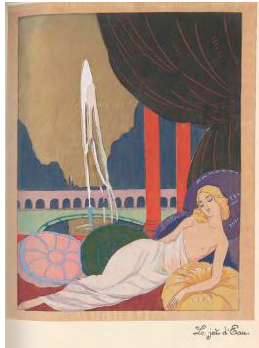
Fig. 1: Charles Baudelaire, Les Fleurs du mal , illustrations by Maggie Monier, pseud. for Madeleine Mounier, Paris: Librairie Nilsson, Collection Lotus, 1926.

Maggie Monier's illustration of "Le Jet d'eau" (fig. 1) contains the textual directives in a straightforward visual recounting of Baudelaire's