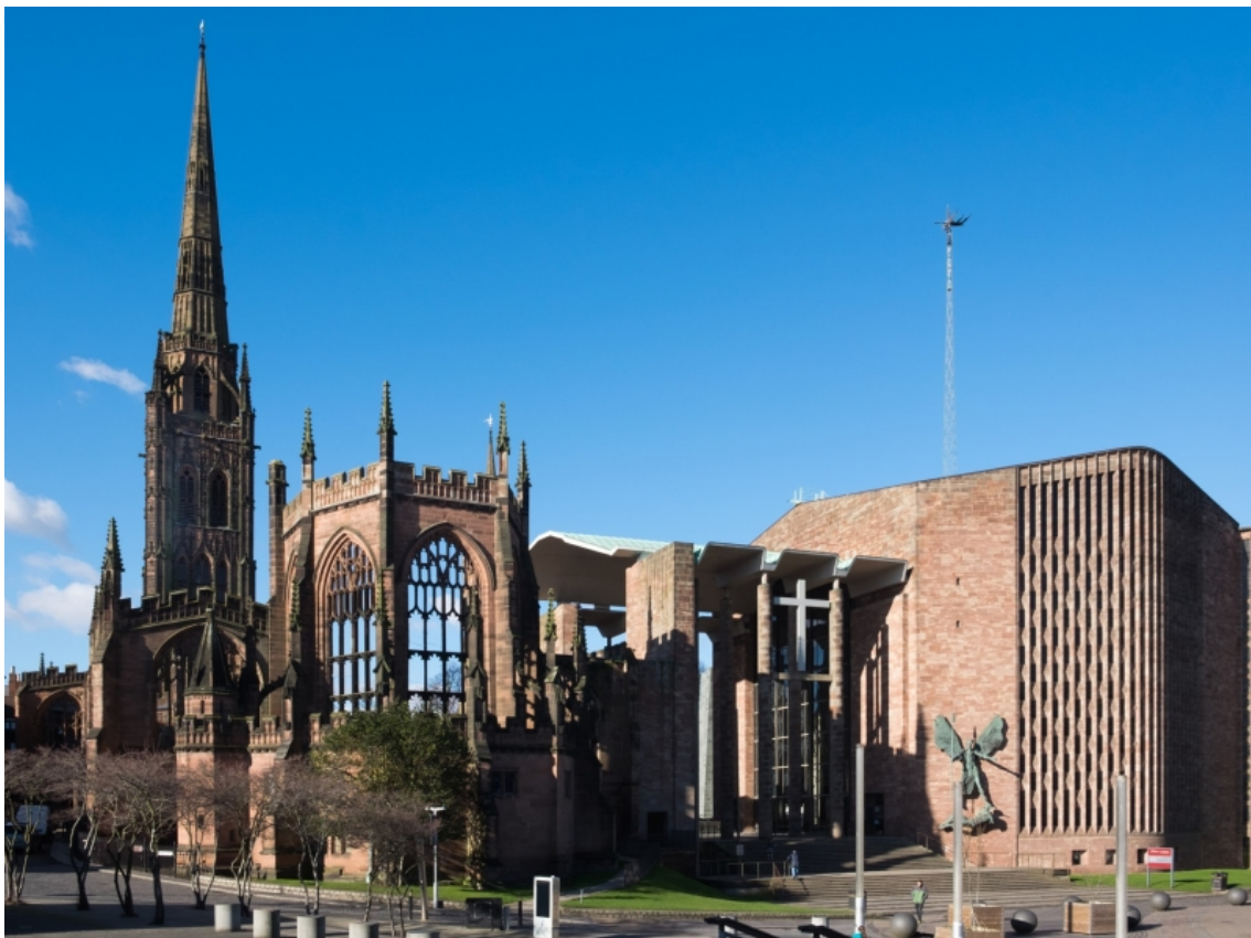
Illustration 1. Basil Spence’s reconstruction of Coventry Cathedral (1962).